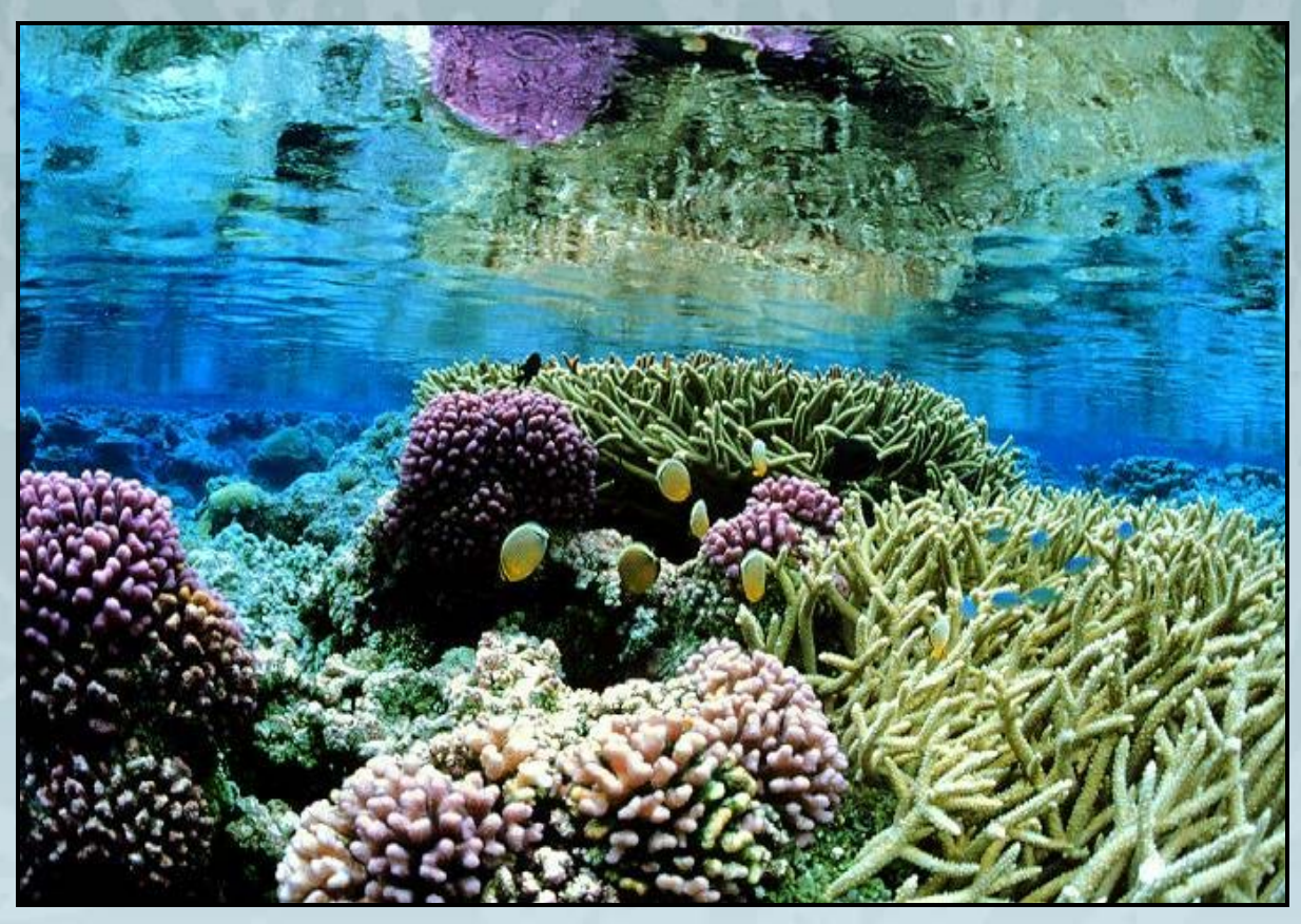
Working to preserve and protect coral reef ecosystems